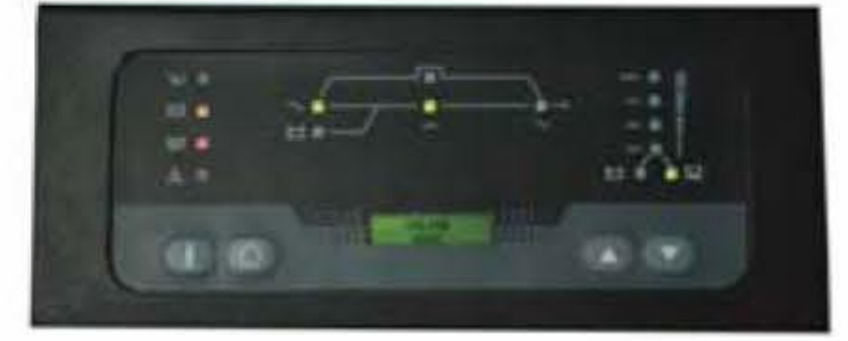
Friendly LED Display