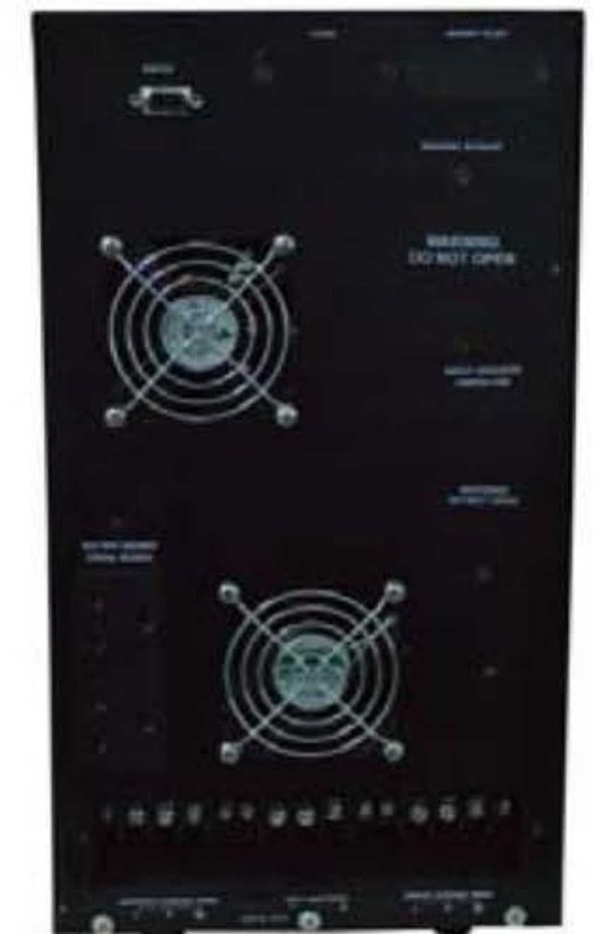
2 and 3 kVA Rear View

* Rated output at 25° C ** Lower range 80 ~ 176 Vac is acceptable under 50 ~ 100% loading condition. Customise variants can be offered against specific customer requirements. Product Development is continuous process and all specifications are subject to change without prior notice.