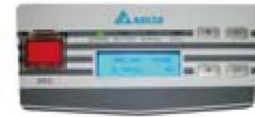
Control and LCD Display Panel

All specifications are subject to change without prior notice.