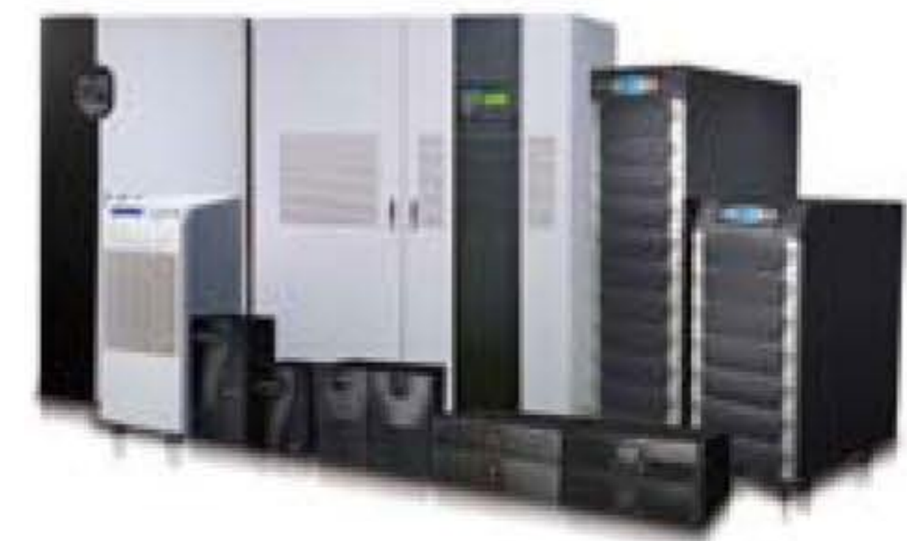
Delta offers full range UPS solutions from 600 VA to 4000 kVA to fulfill your power security needs.