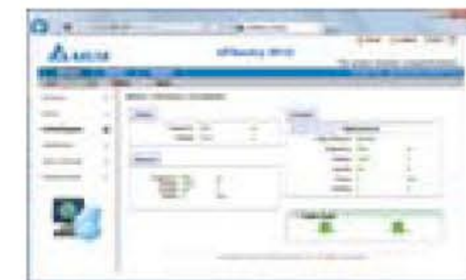
Advanced UPS Management Software - UPSentry 2012