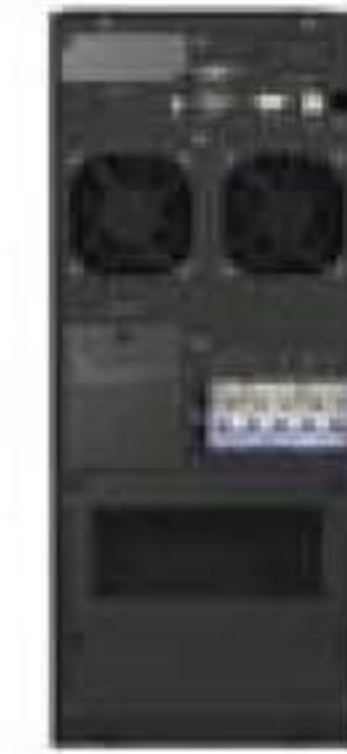
10 kVA Rear View