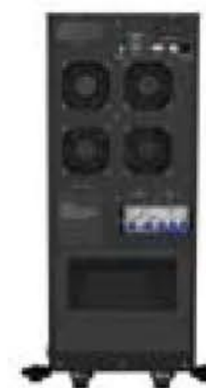
15/20 kVA Rear View