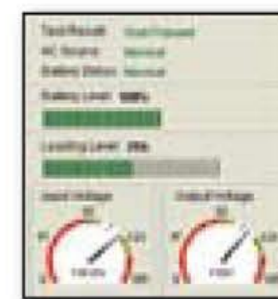
Power Management Software