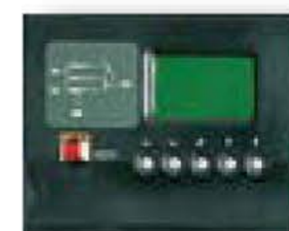
Control and LCD Display Panel

All specifications are subject to change without prior notice.