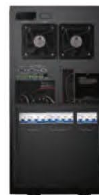
30/40 kW Rear View