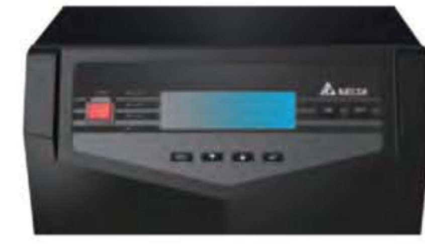
Control and LCD Display Panel

* When input voltage is 242 ~ 324/140 ~ 187 Vac, the sustainable loading is from 70% to 100% of the UPS capacity. All specifications are subject to change without prior notice.