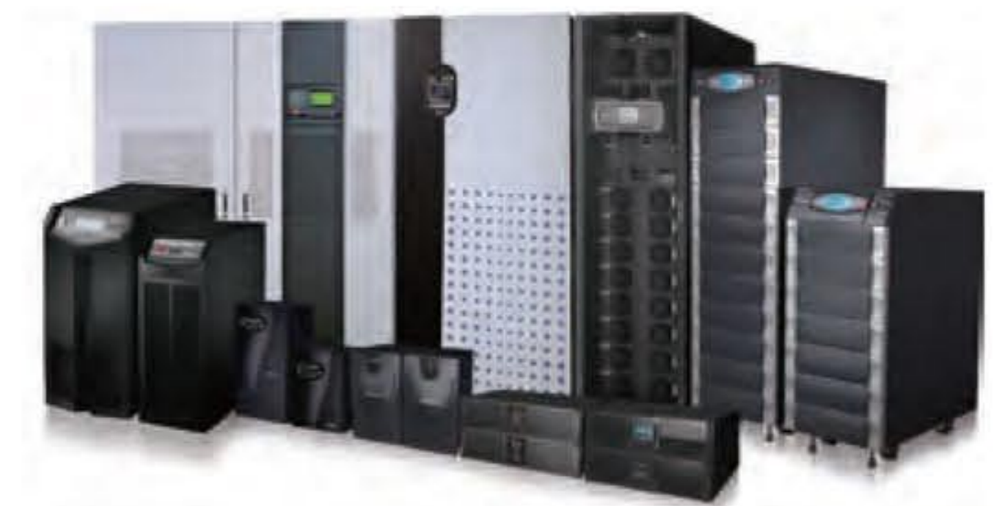
Delta offers a full range of UPS solutions from 600 VA to 4000 kVA to fulfill your power security needs.