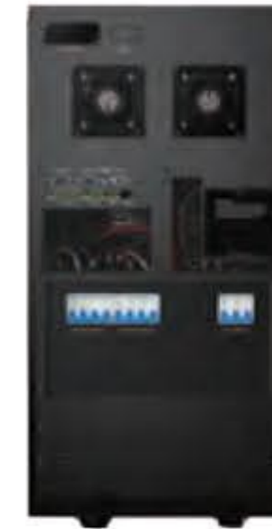
20 kW Rear View